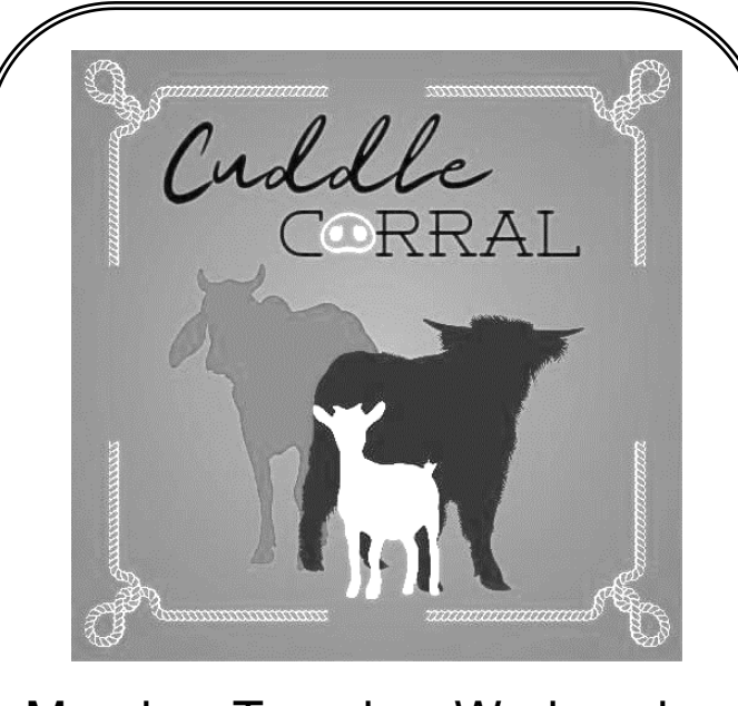
Monday, Tuesday, Wednesday 5-9pm - Upper Fairgrounds